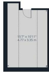
First Floor Building 2