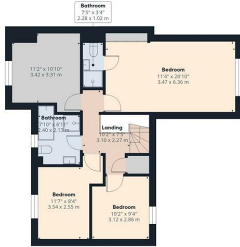
First Floor Building 1